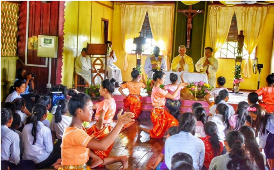
Traditional dancing during the Confirmation Mass at Kompong Koh.